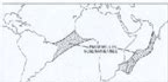
Fig. 10 - Les continents dérivent d'un bloc unique, les continents anciens, les continents nouveaux.