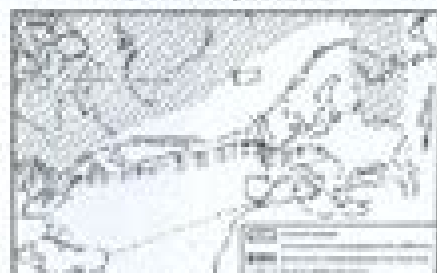
Les continents dérivent d'un bloc unique, les continents anciens, les continents nouveaux.