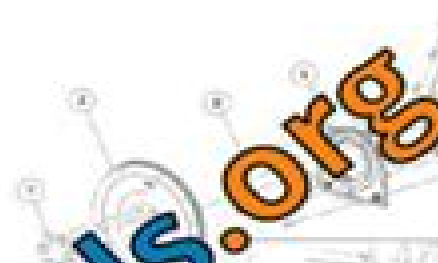
Fig. 71: Exploded View Of Timing Chain & Crankshaft Rear Seal With Torque Specifications Lower End Components Courtesy of FORD MOTOR CO.