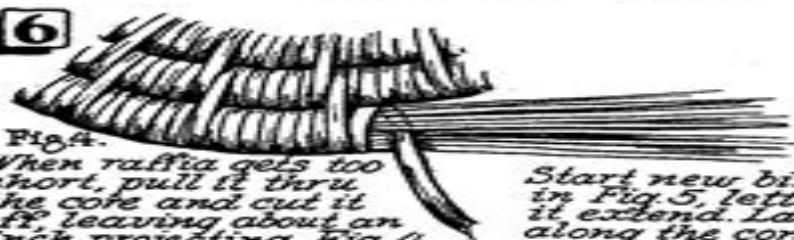
Fig. 4. When raffia gets too short, pull it thru the core and cut it off, leaving about an inch projecting. Fig. 4.

Start new binder as shown in Fig. 5, letting an inch of it extend. Lay both ends along the core and wrap around them to fasten them.