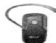
On the left