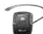
On the right