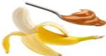
BANANA + ALMOND BUTTER