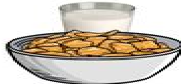
MILK + CEREAL