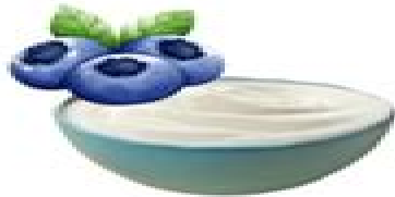
GREEK YOGURT + BLUEBERRIES