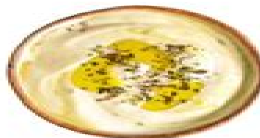
COTTAGE CHEESE DIP