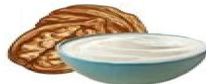
GREEK YOGURT + WALNUTS