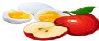
APPLE + BOILED EGGS