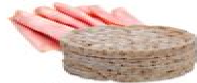
RICE CAKES + TURKEY