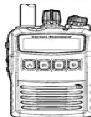
4 key Type