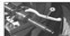
A. Front Brake Lever

Warning: It is better to avoid braking to the right application of both brakes or not to brake at all. Reduce your speed before you get into the corner. For emergency braking, disengage the clutch, and concentrate on applying the brakes as hard as possible without slipping.