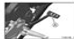
B. Rear Brake Pedal