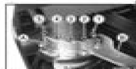
A. Spring Preload Adjuster B. Arrow

Turn the adjuster counterclockwise to increase spring preload and stiffen the suspension. Turn the adjuster clockwise to decrease preload and soften the suspension.