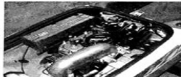
Overall view of the popular Model 750 Series twin cylinder installation.