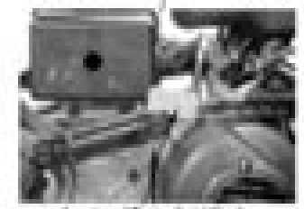
Location of Engine Serial Number