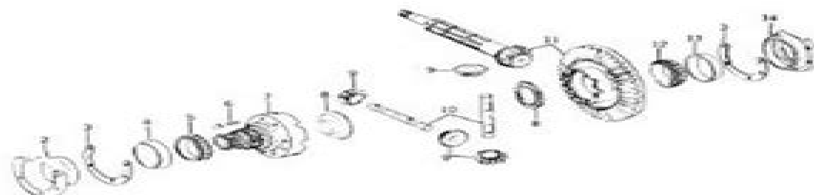
Fig. 104—Exploded view of differential used on all models.

108. BACKLASH ADJUSTMENT. With differential carrier bearing preload adjusted as outlined in paragraph 107, adjust backlash between main drive bevel gear and pinion shaft to 0.006-0.012 by transferring bearing quill shims from one side to the other as required. Moving shims from left to right will increase backlash. Do not change the total thickness of all shims during backlash adjustment or the previously determined preload adjustment will be changed.