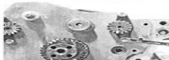
Balancer Shafts and Thrust Plates

Balancer Shaft Specification Thrust Plate Cap Screws—Torque 40 N·m (29.5 lb-ft)