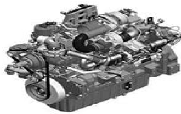
Final Tier 4 6000 Engine — Left Front View