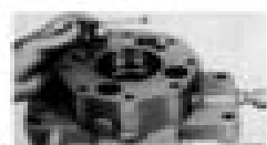
Fig. 2 - PTO assembly

The tractor is designed to operate with a maximum gross weight of 2,100 kg (4,630 lb). The maximum gross weight of the tractor with a full PTO load is 2,100 kg (4,630 lb). The maximum gross weight of the tractor with a full PTO load and a full rear-end load is 2,100 kg (4,630 lb).