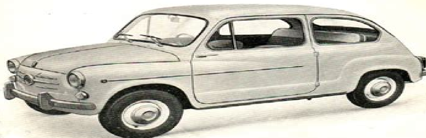
Fig. 1. - « Berlina » Mod. 600 D.

DATI PRINCIPALI E CARATTERISTICHE DATI DI MONTAGGIO ED ISTRUZIONI PER LE REVISIONI