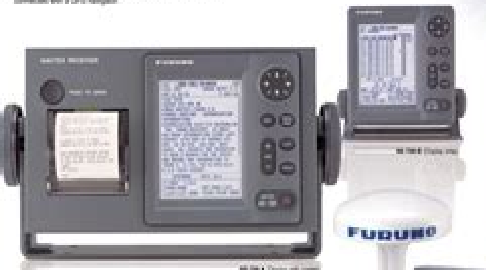
Dual-channel NAVTEX Receiver

The NX-700-A consists of a receiver, display with printer and antenna unit. The NX-700-B has a low profile, stylish display without a printer, receiver and antenna unit. The compact omnidirectional antenna requires no grounding because it is a loop antenna. In addition, the antenna incorporates a high-performance preamp within the compact body, which gives reliable and uninterrupted reception without an extra whip antenna.