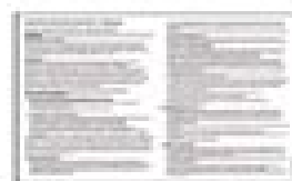
Warning & Declaration booklet