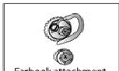
Earhook attachment (not supplied in all regions)