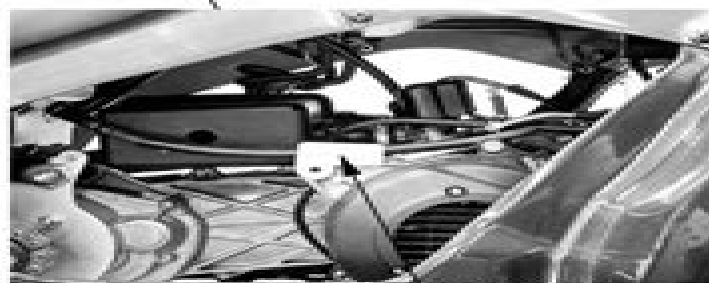
Location of Engine Serial Number