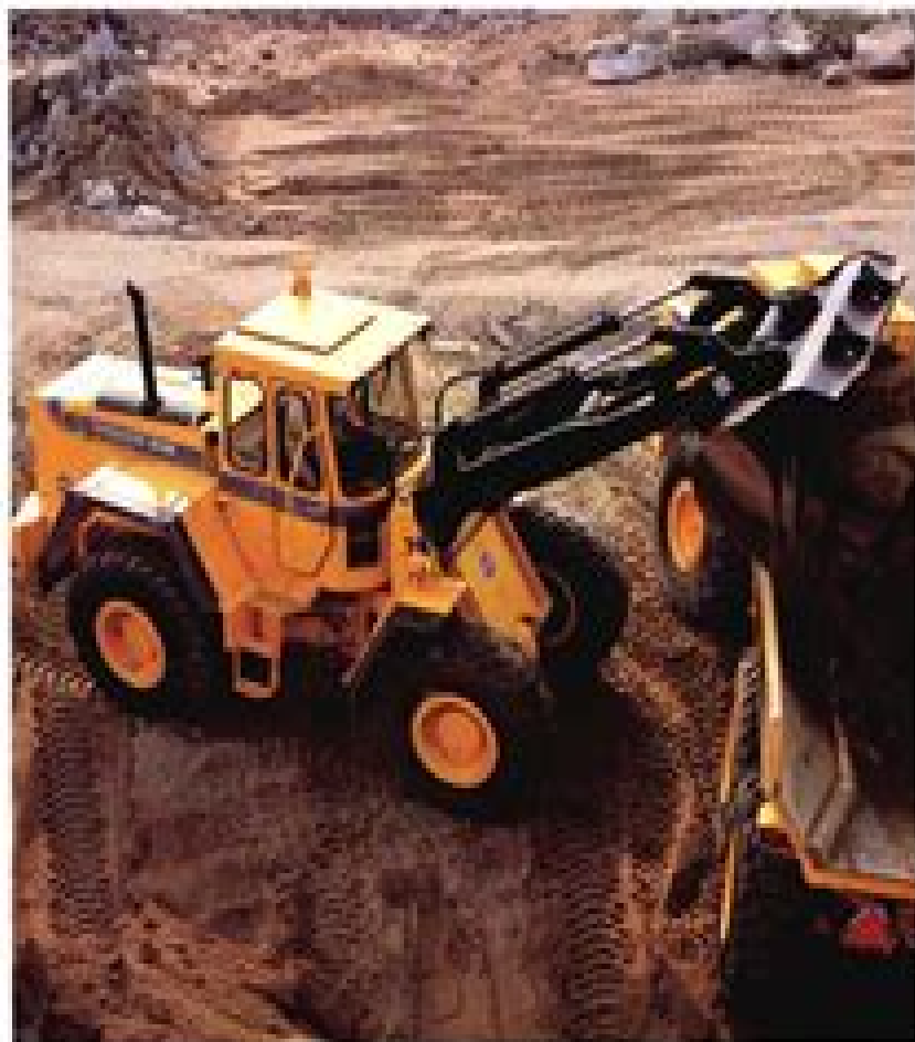
Specification Volvo BM Loader 4400