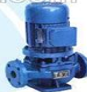
ISG water pump