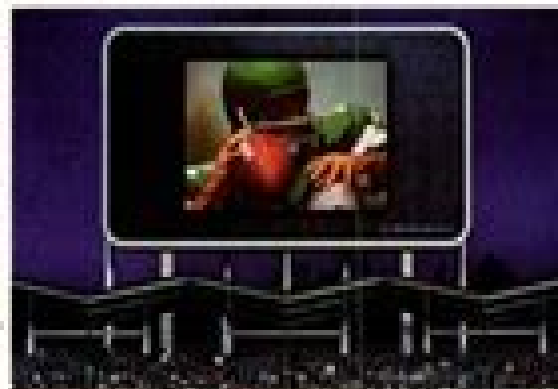
It's original Diamond Vision from the million dollars.

139 channel cable ready frequency-synthesized tuning. Comb filter. Automatic Picture Latitude Circuitry (to maintain the