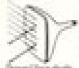
Diamond Vision screen where ambient light is absorbed by the screen, resulting in a clearer image.