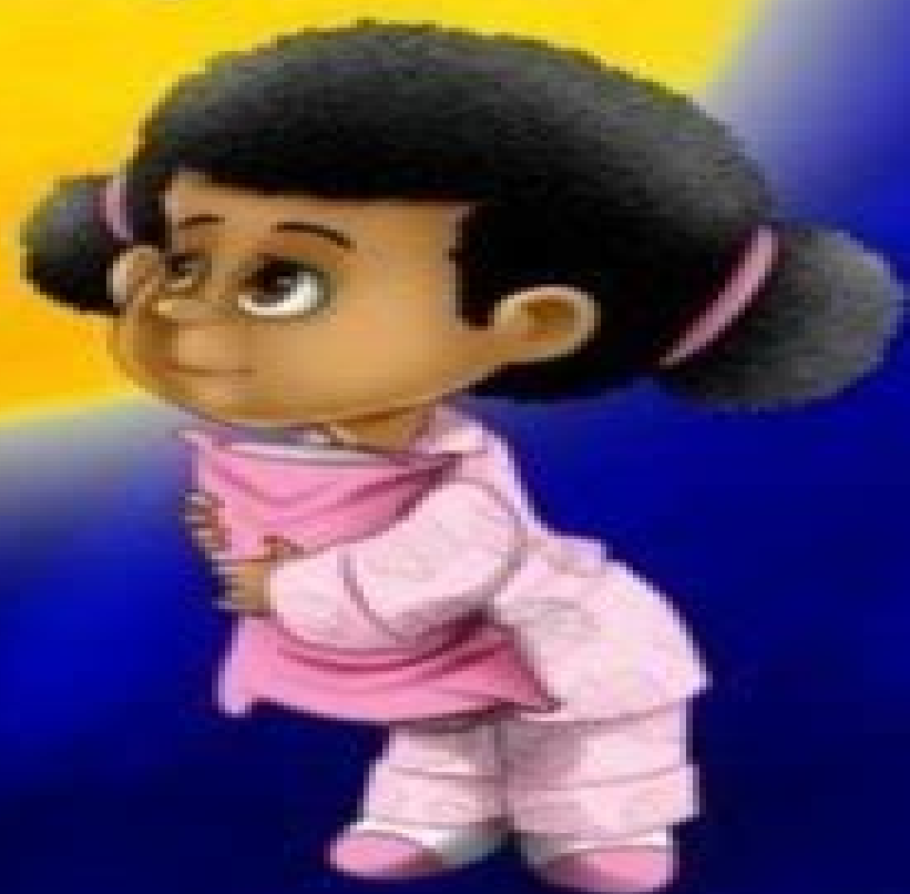
Illustration by Aveira Studio