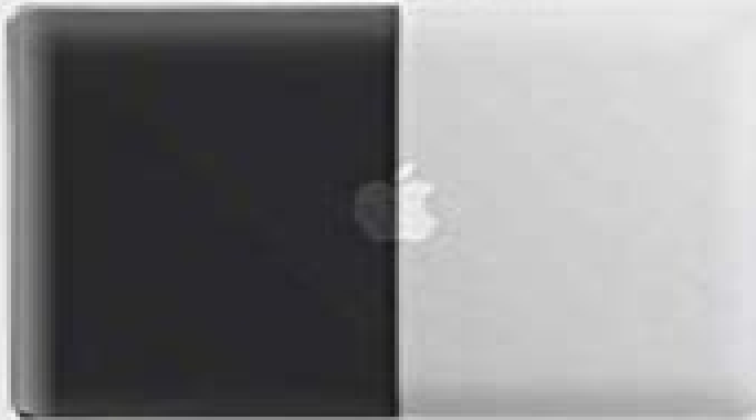
Apple logo On