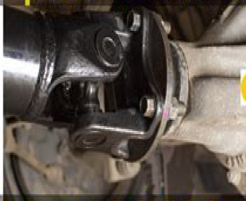
Factory-supplied tailshaft to rear-differential connection.