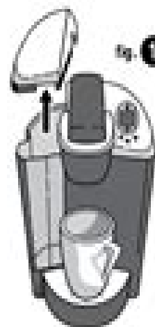
Fig. 1 Setting Up Your Brewer

NOTE: If Brewer has been exposed to temperatures below freezing, allow Brewer at least two hours to reach room temperature before brewing. A frozen or extremely cold brewer will not operate.