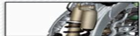
Adjustable Uni-Trak® Suspension System