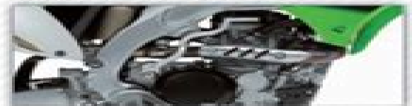
Easy Starting Digital Fuel Injected Engine