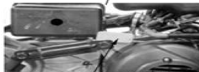
Location of Engine Serial Number