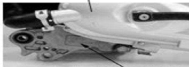
Location of Engine Serial Number