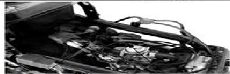
Auto Bystarter Wire

Remove the frame right side cover. (⇒2-4) Disconnect the auto bystarter wire connector. Remove the met-in box. (⇒2-3)