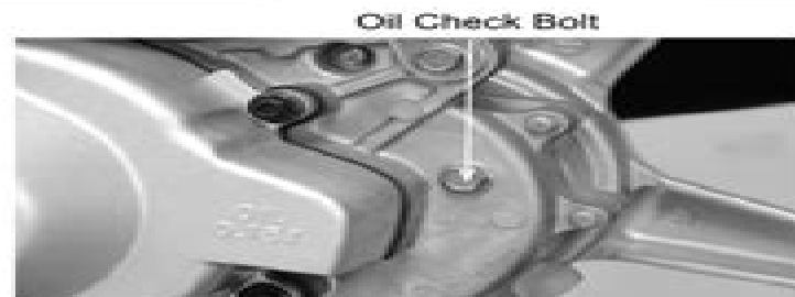
Oil Check Bolt