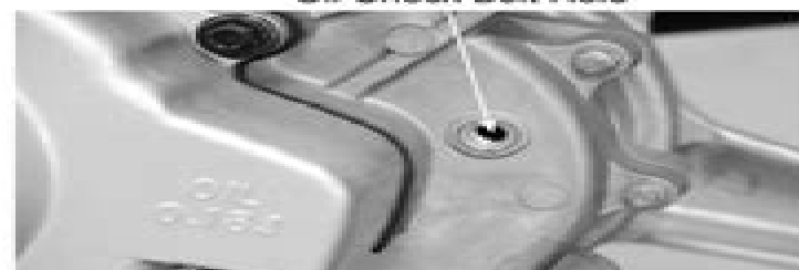
Oil Check Bolt Hole