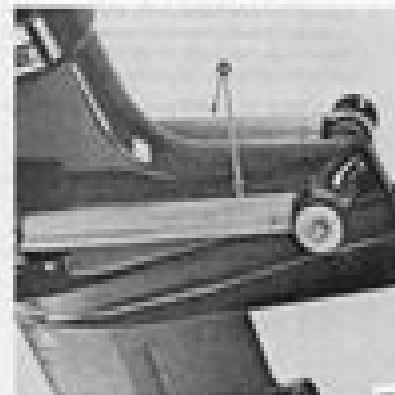
a. Holding trim piston