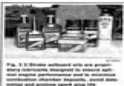
Fig. 5 2-Stroke outboard oils are proprietary lubricants designed to ensure optimal engine performance and to minimize combustion chamber deposits, avoid sludge, and prolong spark plug life.