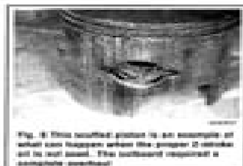
Fig. 6 This scuffed piston is an example of what can happen when the proper 2-stroke oil is not used. The outboard required a complete overhaul.

Remember: It is this oil, mixed with the gasoline, that lubricates the internal parts of the engine. Lack of lubrication due to the wrong mix or improper type of oil can cause catastrophic powerhead failure.