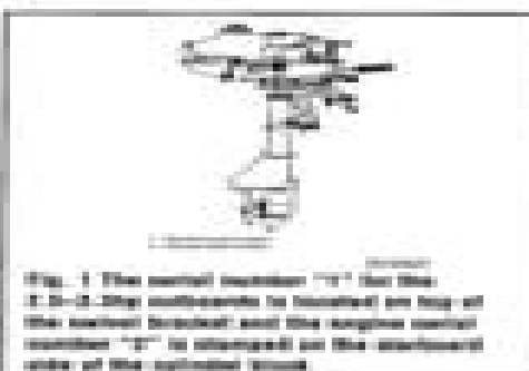
Fig. 1 The serial number "1" for the 2.5-5.5hp outboards is located on top of the stern bracket and the engine serial number "2" is stamped on the transom/strake plate.

Use only Quicksilver Premium Plus TC-100 two-cycle oil or 100W20 Motulene Marine Manufacturers Association (MMA) certified 2-stroke lubricants. These oils are proprietary lubricants designed to ensure optimal engine performance and to minimize combustion chamber deposits, avoid sludge, and prolong spark plug life. 2-stroke oil lubricant is available in two types: 2-stroke gas outboard oil. Never use automotive motor oil.