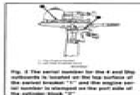
Fig. 3 The serial number for the 4 and 5hp outboards is located on the top surface of the stern bracket "1" and the engine serial number is stamped on the port side of the transom/strake plate "2".