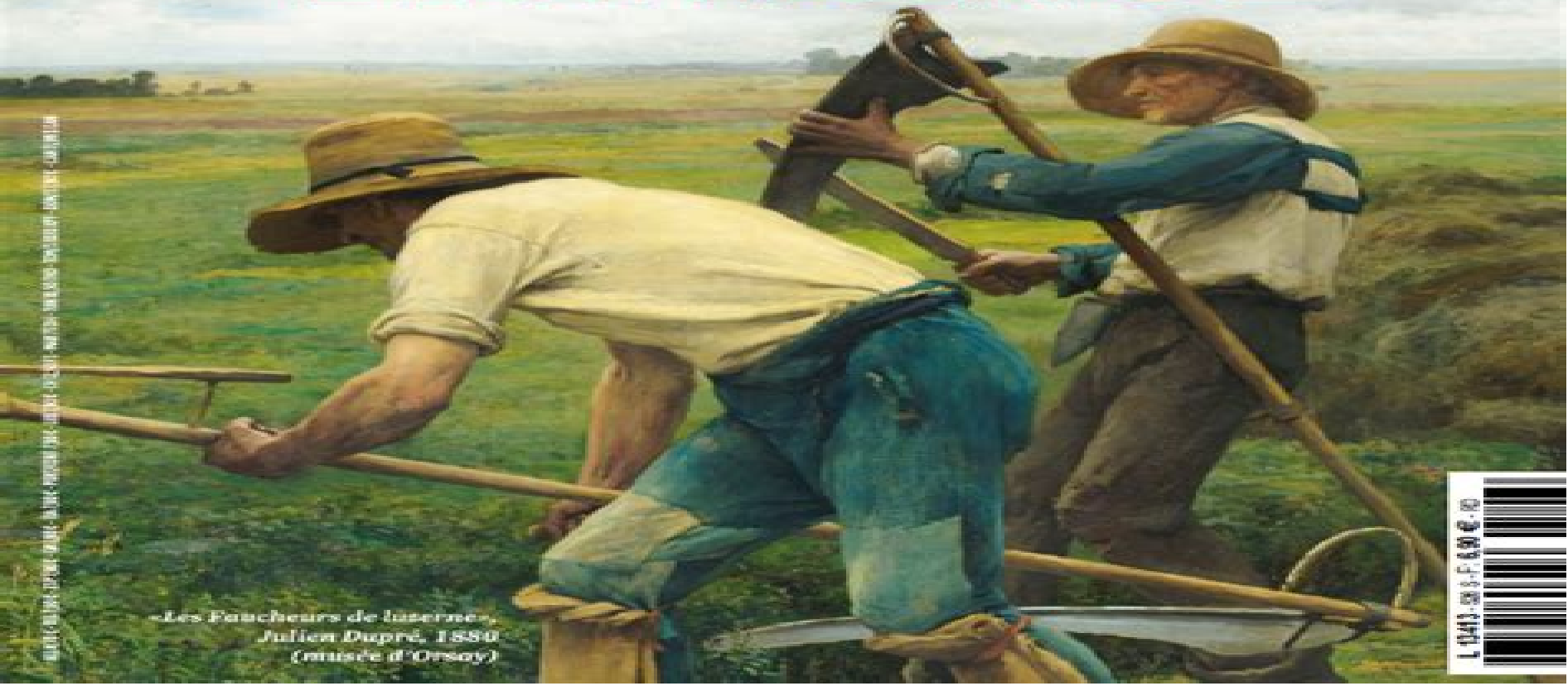
«Les Faucheurs de luzerne», Julien Dupré, 1880 (musée d'Orsay)