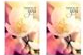
Thinking of you cards