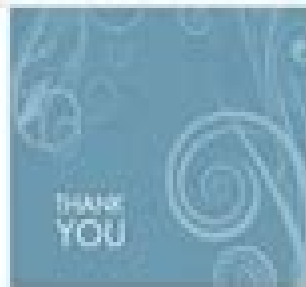
Thank you cards