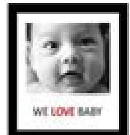
Baby photo album