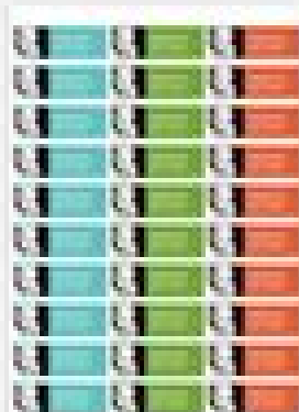
Photo address labels