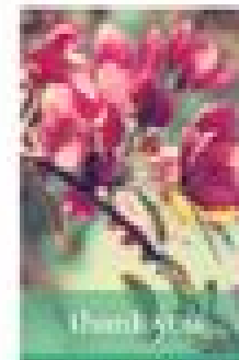
Thank you cards