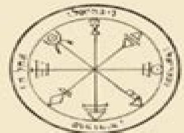
Pentacle de Vénus