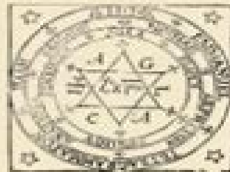
Pentacle de Salomon