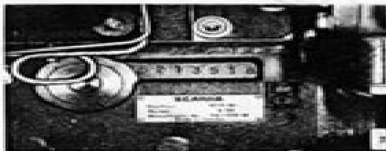
Fig. 10. Número del motor y designación del tipo de motor

La designación del tipo y el número del motor están especificados en una placa fijada al lado derecho superior del bloque del motor. El número del motor también está estampado en el bloque de cilindros arriba de esa placa.