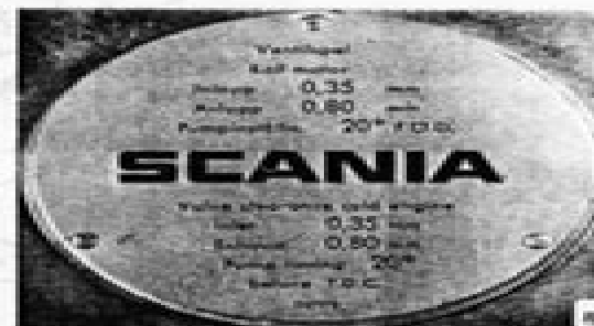
Fig. 11. Placa en la tapa de las válvulas

Una placa especificando el juego de las válvulas y los ajustes de la bomba de inyección se encuentra en la tapa de las válvulas.