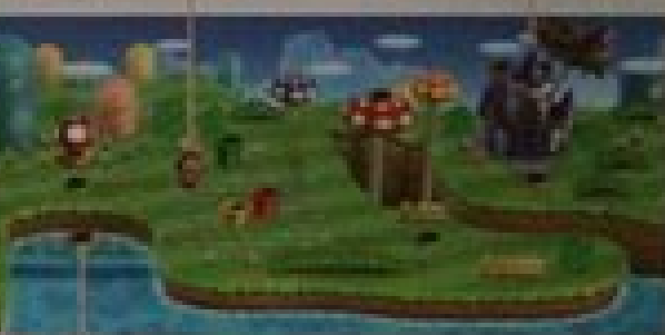
Ver los mundos 2 y 3