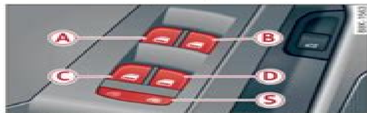
Fig. 35 Section of the driver's door: controls.

The driver can control all power windows.