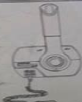
COMMANDER 3000 CLASSIC PANEL MOUNT REMOTE CONTROL