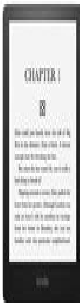
Paperwhite (new) 6.8 inch 205 grams