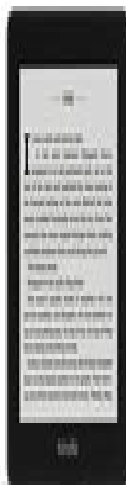
Paperwhite (current gen) 6 inch 182 grams