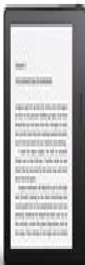
Kindle (HD) 8.9 inch 188 grams