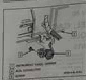
Figure 1 Air Filter Location