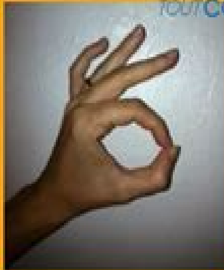
PARFAIT / ARGENT