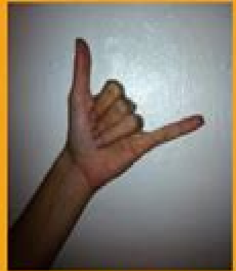
DÉTENTE / BOIRE