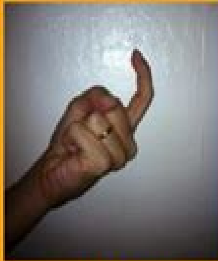
VIENS ICI / INSULTE