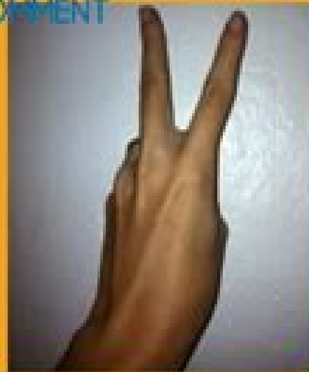
VICTOIRE / PAIX