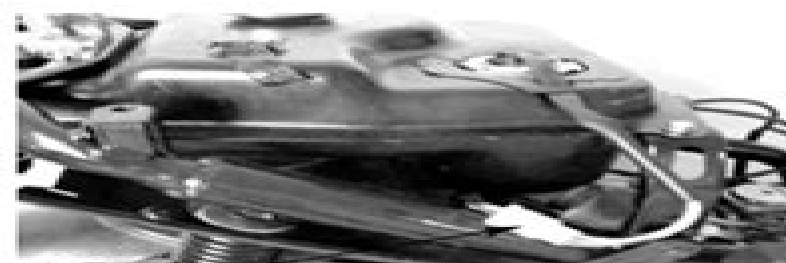
Fuel Unit Wire Connector