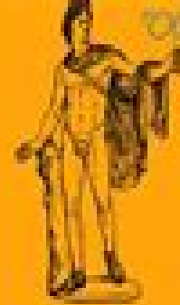
Apollon : dieu de la musique et poésie