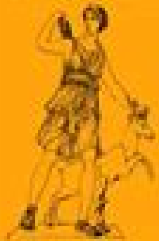
Artémis : déesse de la lune et de la chasse