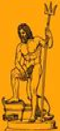
Poséïdon : dieu des mers et des océans. Il a un trident.