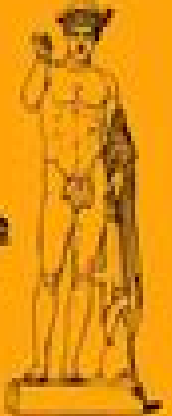
Hermès : messager des dieux