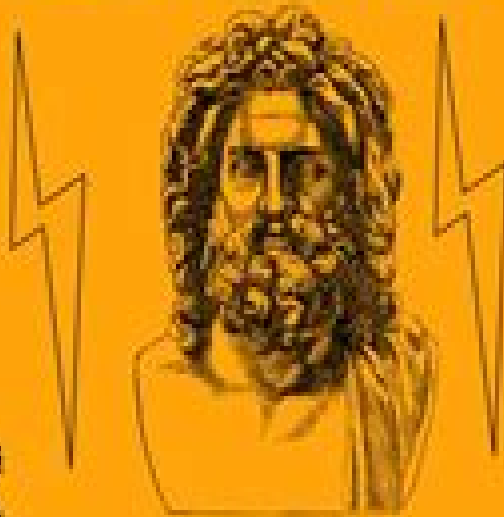
Zeus : Chef de l'Olympe. Dieu des dieux grecs et roi de l'Olympe