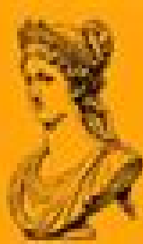
Hestia : déesse grecque de la chasse