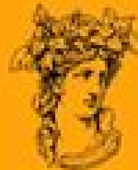
Dionysos : dieu grec du vin et de la fête