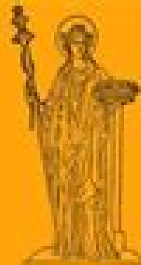
Déméter : moisson et récoltes