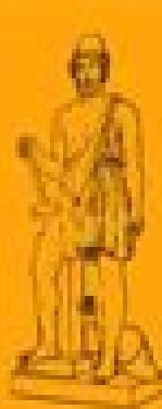
Héphaïstos : dieu des forgerons