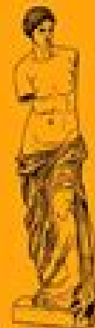
Aphrodite : déesse de l'amour et de la beauté