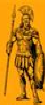
Arés : dieu de la guerre