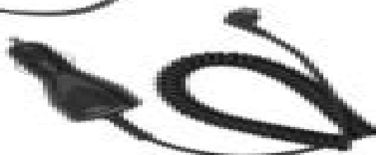
Vehicle Power Charger