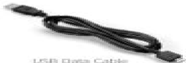
USB Data Cable