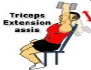
Triceps Extension assis