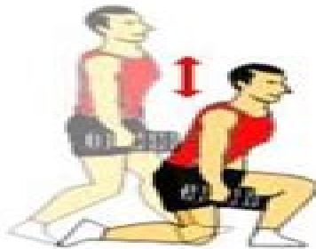
Fessiers Fente avant