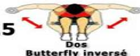
Dos Butterfly inversé