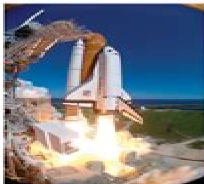
Figure 1 The combustion of hydrogen fuel was used to launch the space shuttle into orbit. Aboard the shuttle, hydrogen fuel cells used the same chemical reaction to provide astronauts with electricity and water.