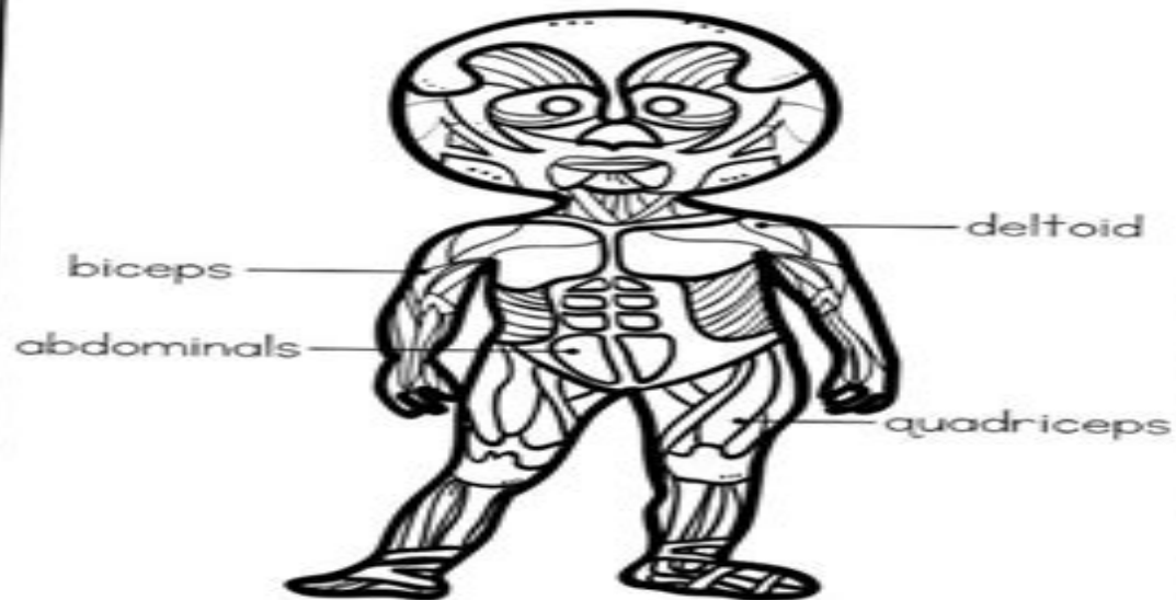
MUSCLES ANTERIOR VIEW