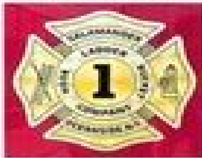
fire engine badge