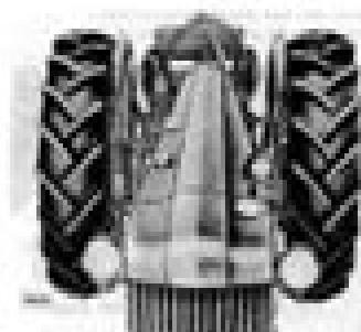
Steering Wheel for Tractor Position

The steering wheel, often to the left of the tractor seat, has, generally at each end, a wheel, one of the wheels at all times.