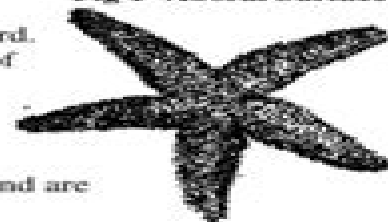
Fig 1 - Aboral Surface