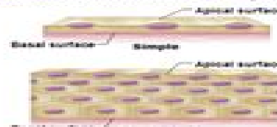
(a) Classification based on number of cell layers

Note that basal cells regenerate; as apical cells slough off, they are replaced by basal cells